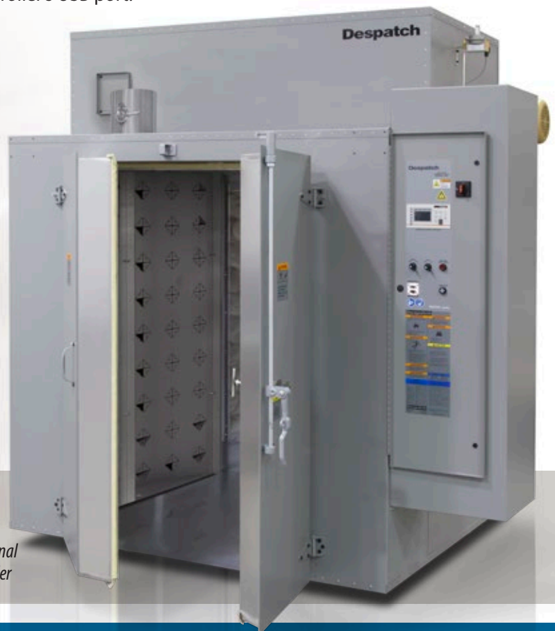
Shown with optional Protocol 3 controller