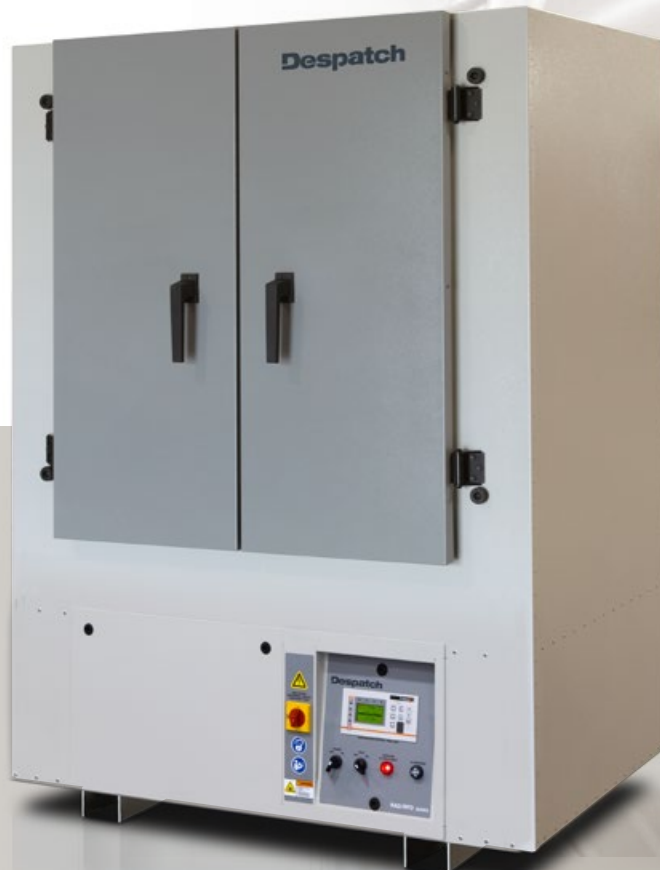
New smaller footprint on RAD2-19 model

This oven is equipped with the Protocol 3™ microprocessor-based temperature and hi-limit controller with large LCD display and real time clock for auto start capability. The LCD display shows temperature readings along with clear, detailed information on oven status. The data-logging functionality enables reporting and analyzing and data files can be exported via the controller's USB port. Modbus RS485 communications are included for easy data access.