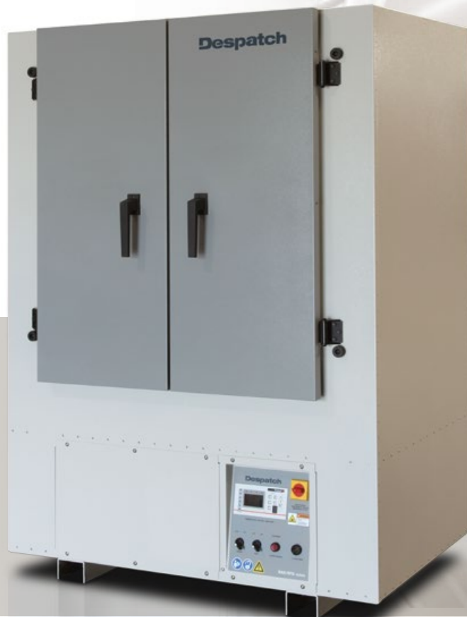
New smaller footprint on RAD2-19 model

This oven is equipped with the Protocol 3™ microprocessor-based temperature and hi-limit controller with large LCD display and real time clock for auto start capability. The LCD display shows temperature readings along with clear, detailed information on oven status. The data-logging functionality enables reporting and analyzing and data files can be exported via the controller's USB port. Modbus RS485 communications are included for easy data access.