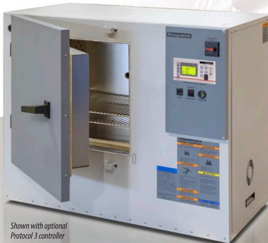
Shown with optional Protocol 3 controller

Standard digital controls regulate temperatures within tight tolerances and provide high limit protection. For more advanced control choose the optional Protocol 3™ microprocessor-based temperature and hi-limit controller with large LCD display and real time clock for auto start capability. Data-logging functionality enables reporting and analyzing and data files can be exported via the controller's USB port. Modbus RS485 communications are included for easy data access.