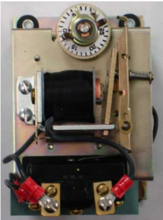
Part number 012425

Our standard purge timer part number 012425 has become obsolete, and is being replaced by part number 253100. See page 2 of the bulletin for wiring changes.