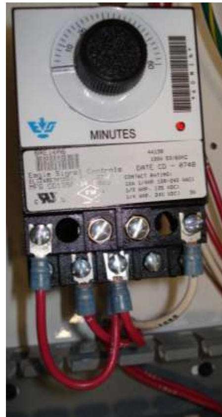
Part number 253100