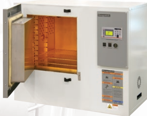
RFD1-42 benchtop oven

*50 hertz electrical is available on all models