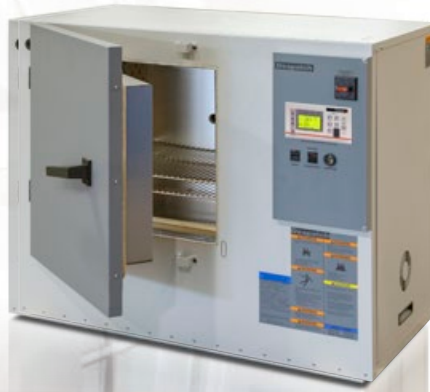
RFD1-42 benchtop oven

*50 hertz electrical is available on all models