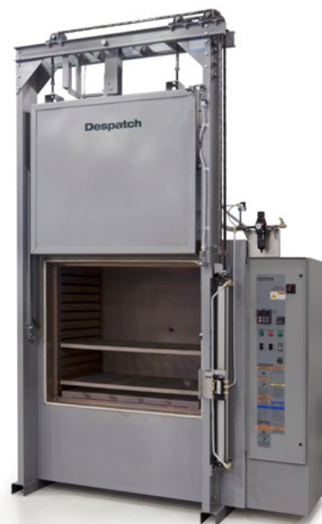
RFF2-35 with optional pneumatic lift door